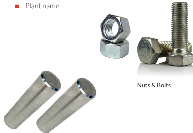
Nuts & Bolts