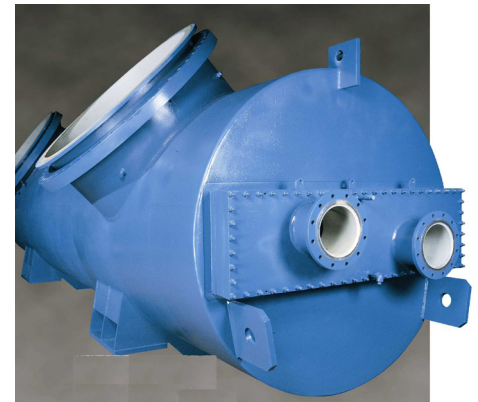
Cooler-Compressed Gas-J-Front Cover

For more information and to order OEM spare parts, please email us at sales@thermalengint.com or call (323) 726-0641.