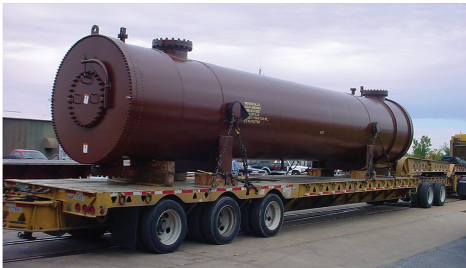
Compressed Gas Cooler

Whether you are looking for plate fin, bimetallic fin tube, or bare tube, TEi's Compressed Gas Coolers offer high-efficiency and long-term availability.