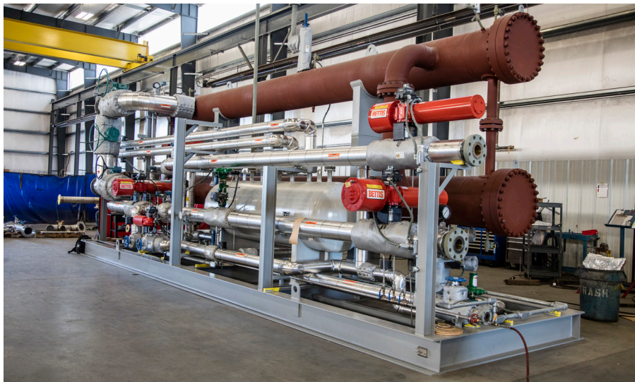
Fuel Gas Performance Heater Skid

Other primary heat exchanger equipment designed and manufactured by TEi are Rotor Air Cooler Kettle Boilers (Combined Cycle); Rotor Air Cooler (Simple Cycle); CCW Heat Exchangers (Combined Cycle).