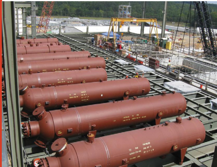
TRAIN OF FEEDWATER HEATERS