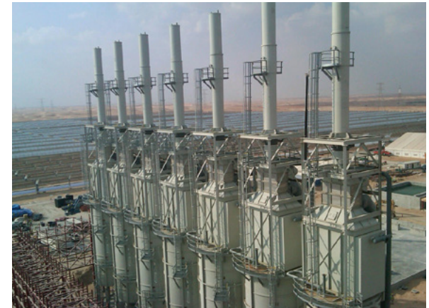
HTF FIRED HEATERS FOR A 100MW PLANT IN UAE