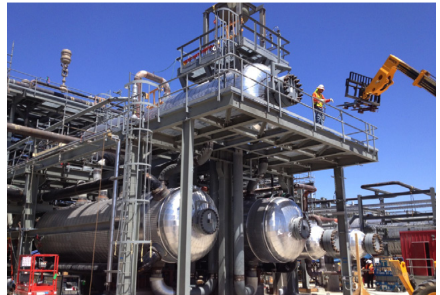
SGS HEAT EXCHANGERS FOR 250 MW CSP PLANT IN CALIFORNIA