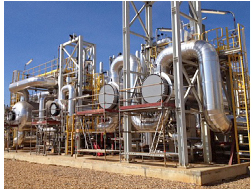
SGS HEAT EXCHANGERS FOR A 50MW PLANT IN SPAIN