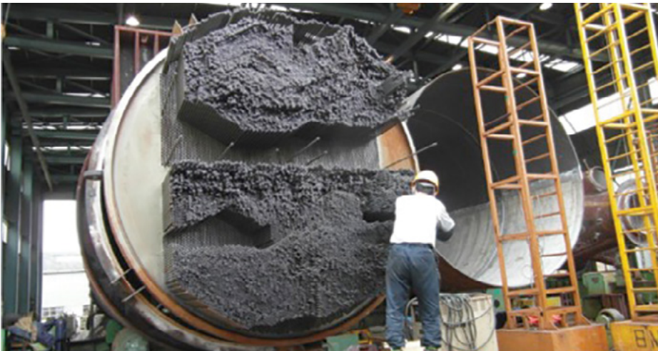
TUBING PROCESS OF MOLTEN SALT TO OIL HX. 13,382, 19mm OD TUBES.