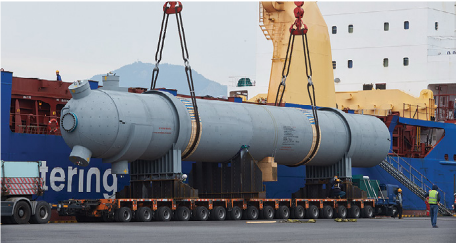
MOLTEN SALT TO OIL 350MT HEAT EXCHANGER FOR A 200MW PLANT IN MOROCCO