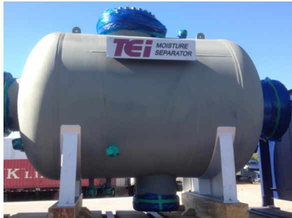
MOISTURE SEPARATION VESSEL FOR A 280MW PLANT IN CALIFORNIA.

TEi has provided other heat transfer equipment such as Moisture Separators, Hot Oil Fired Heaters and Auxiliary Booster Fired Heaters for CSP plants.