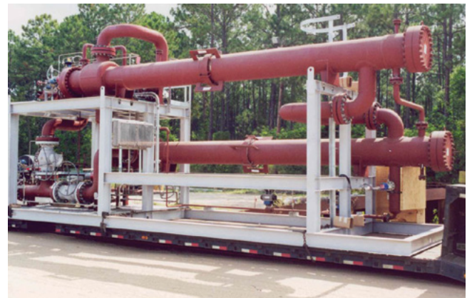
Fuel Gas Heater Skid