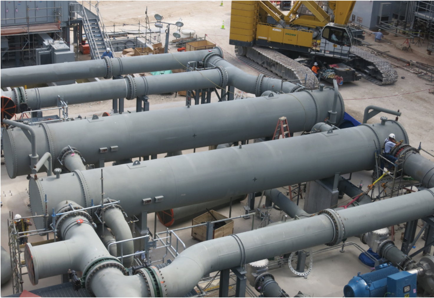
CCW Heat Exchangers