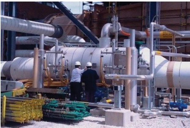
Rotor Air Cooler Kettle Boiler